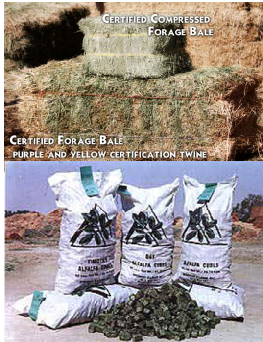
Certified Forage Cubes

What is considered a forage? Any type of hay, forage cubes, or compressed forage bales.