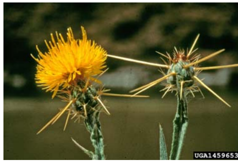
Yellow starthistle, causes chewing disease in horses